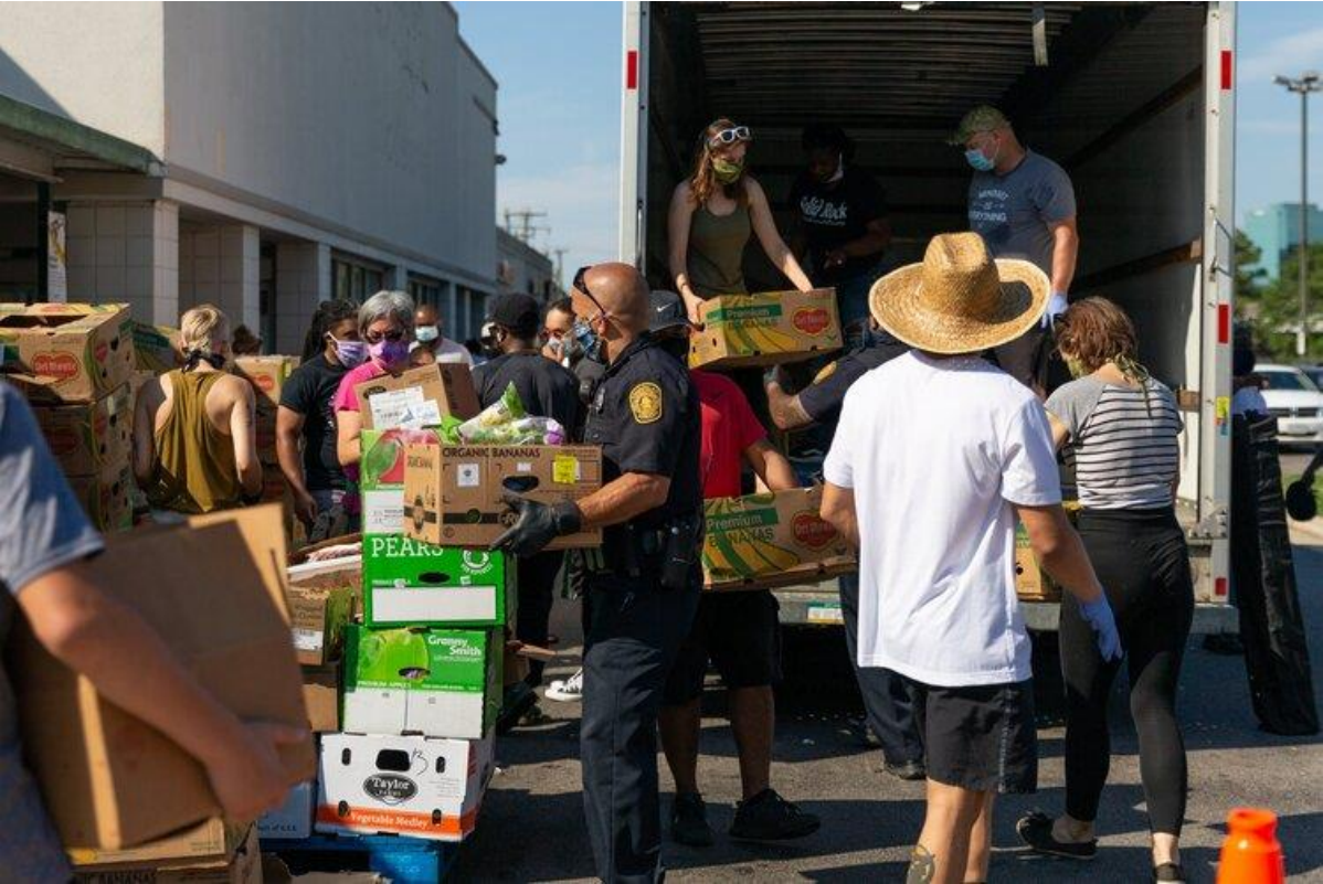
St. Paul's Community Development Corp. creates the Norfolk Food Ecosystem (NFE) | Norfolk, VA