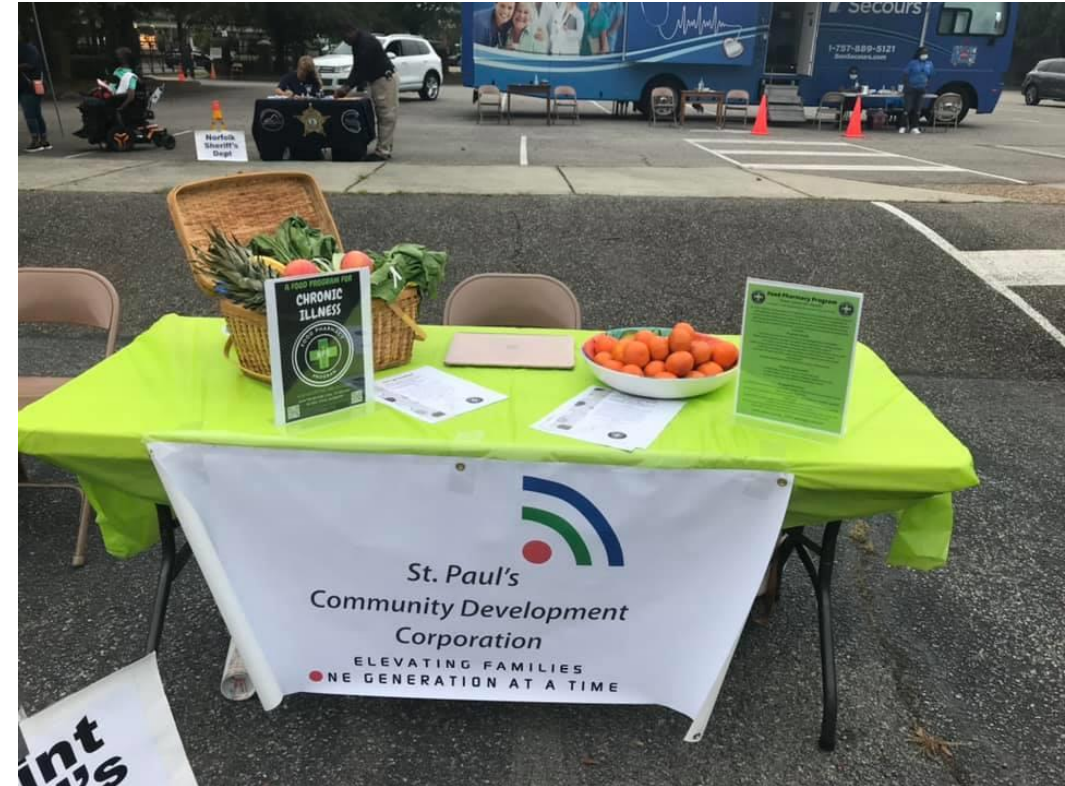
Norfolk Food Ecosystem's Food Pharmacy Program collaborates with Youth Earn and Learn | Norfolk, VA