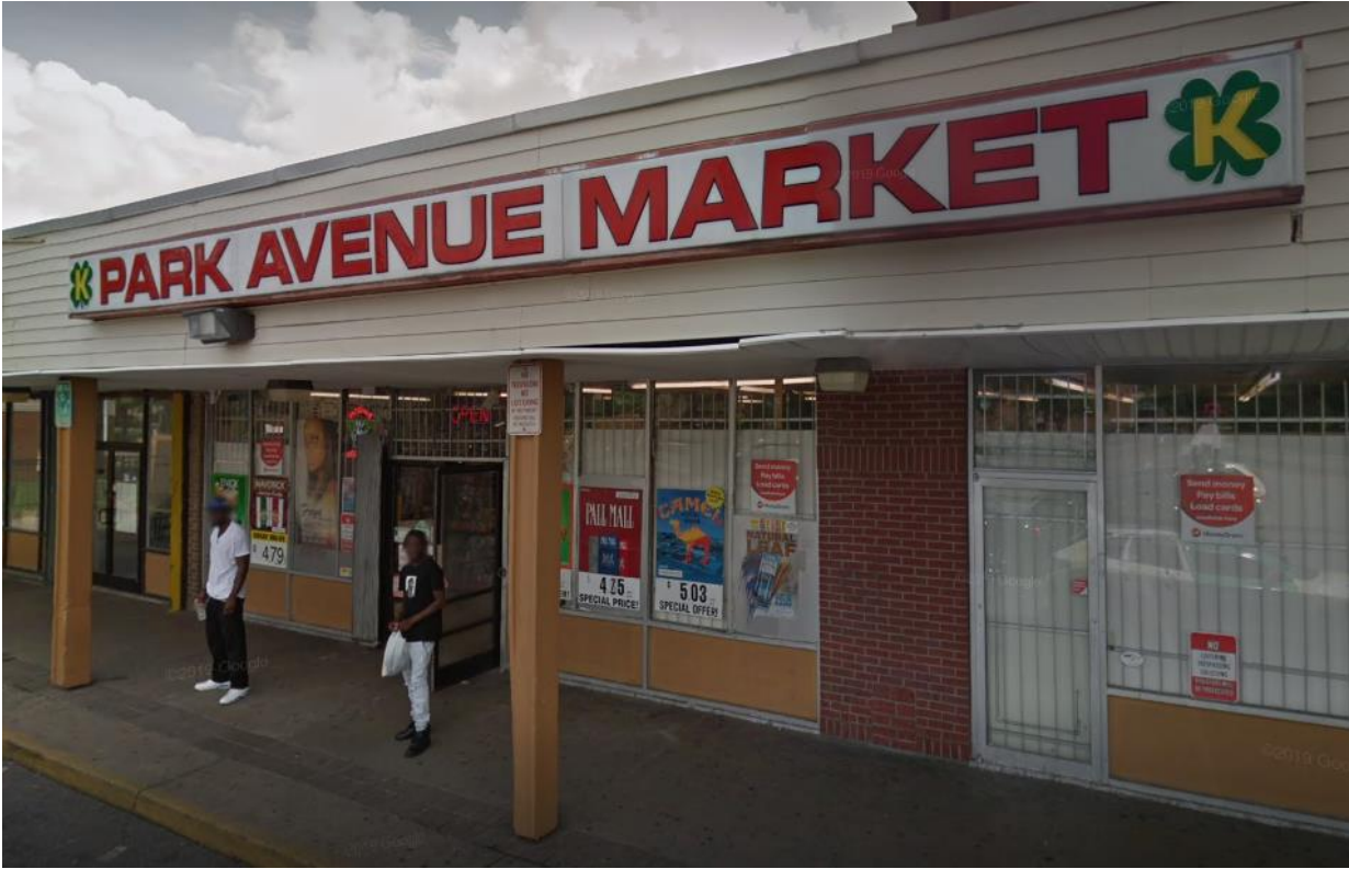
Park Avenue Market, supported by Norfolk Food Ecosystem | Norfolk, VA