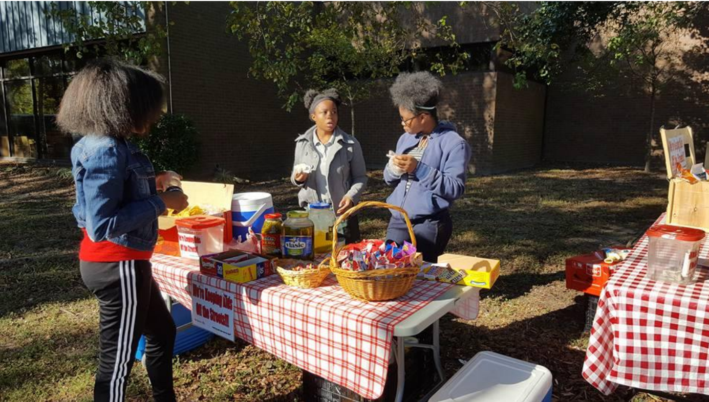
Youth Earn and Learn | Norfolk, VA